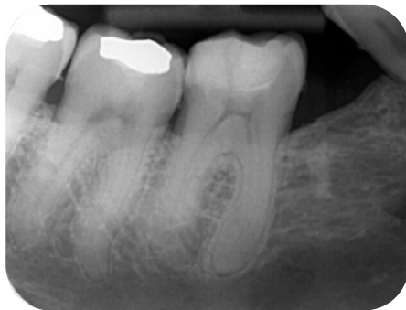
Patient One Pre-Treatment