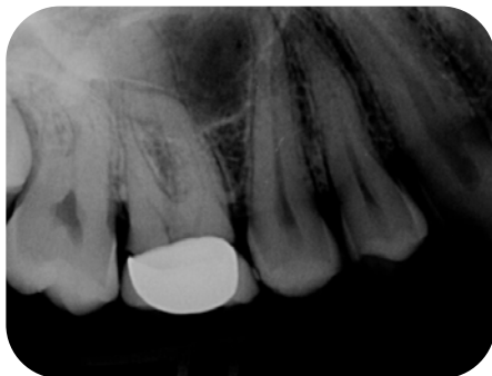
Patient Two Pre-Treatment